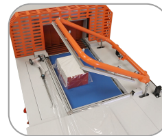
Seal arm with motorized closing—push button or auto pace modes