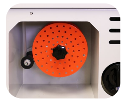
Trim take-up wheel neatly winds trim (optional)