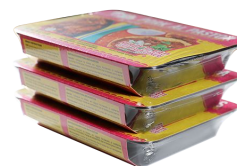
Tamper Evident Protection